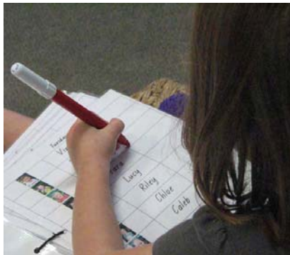
Using literacy in a real-life context; recognising familiar, significant words