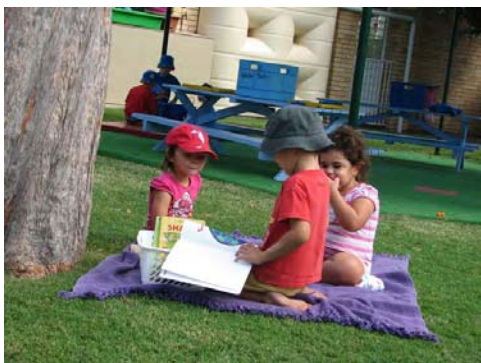
Using literacy for a real-life purpose; pretend reading to entertain

Kindergarten children also enjoy pretending to read. For example, they may make up a story to match the pictures and approximate telling the story from memory.