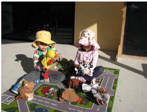
An example of spontaneous word play using understandings built through many games and discussions of rhymes and listening for sounds